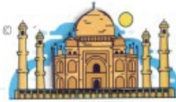
TAJ MAHAL INDIA