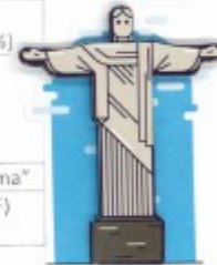
CHRIST THE REDEEMER BRAZIL